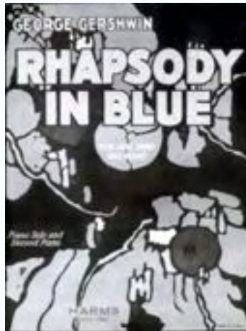
Cover of the original sheet music of the two piano version of Rhapsody in Blue

An early form of blues-like music was a call-and-response shouts, which were a "functional expression... style without accompaniment or harmony and unbounded by the formality of any particular musical structure." A form of this pre-blues was heard in slave field shouts and hollers, expanded into "simple solo songs laden with emotional content." The blues, as it is now known, can be seen as a musical style based on both European harmonic structure and the West African call-and-response